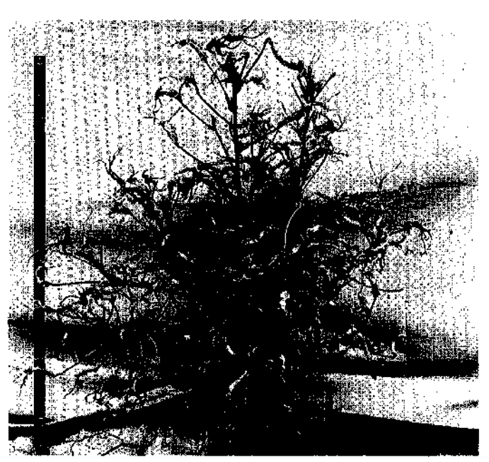
Cotton is extremely susceptible to phenoxy herbicides. This plant was killed when it was accidentally sprayed with 2,4-D.