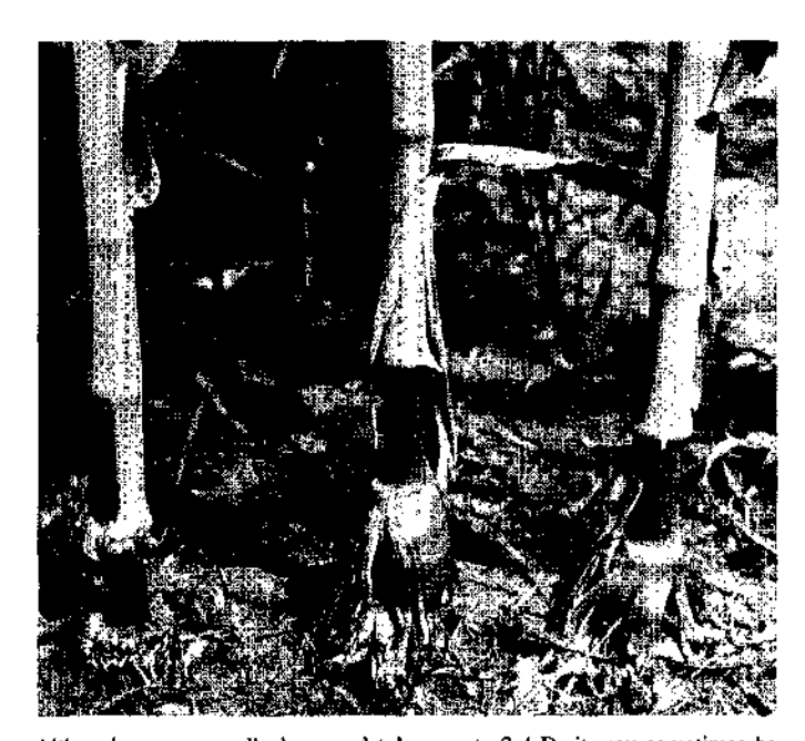
Although corn generally has good tolerance to 2,4-D, it may sometimes be injured. Certain genetic lines are more sensitive than others. Applying excessive amounts and spraying under very hot, humid conditions may increase risk of injury. One injury symptom of 2,4-D is the fasciation or fusion of brace roots as shown. Other symptoms are "onion-leafing" or plants may became brittle and under windy conditions corn may break off or lean.

Dicamba is relatively mobile in soil. It persists in soil much longer than 2,4-D. Persistence is longest under cool and dry or very moist conditions. Like 2,4-D, dicamba is broken down by soil microorganisms, so it usually does not cause problems in subsequent crops when it is applied at relatively low rates.