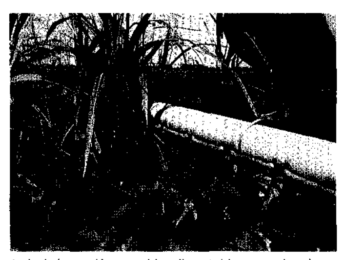
Apply glyphosate with a rope wick applicator to johnsongrass plants that are taller than the cotton crop. The "wipe-on" technique can kill many tall weeds in shorter crops, such as volunteer corn in soybeans or shattercane in grain sorghum. The special rope wicks are inserted into a large plastic pipe. The pipe is a container for the herbicide solution.

Formulated phenoxy herbicide concentrates as well as dicamba, picloram, and glyphosate are available in various strengths. The amount of active ingredient in the concentrate is indicated on the