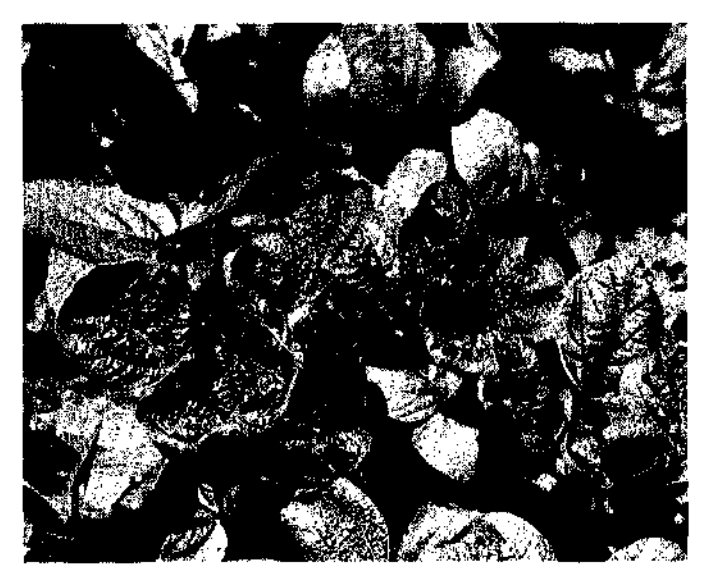
Dicamba that has moved by spray drift to nearby soybeans may cause cupping and crinkling of leaves,

Dicamba has moderate to low toxicological hazard to animals, fish, and birds when it is used according to directions. It is somewhat less toxic than the phenoxy herbicides.