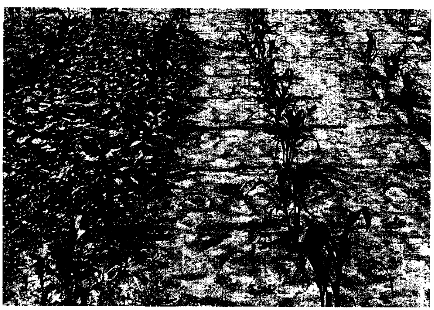
The right half of this field was sprayed with 2,4-D. The left half of the field was not treated.

Example 2: You want to apply 4 pounds active ingredient per acre of a 75 percent wettable powder to 5 acres at 10 gallons spray per acre. Thus 4 pounds \div 0.75 (that is, 75 percent) = 5.3 pounds of product to be applied per acre. Five acres will require 26.7 pounds of product (5 X 5.3) added, with agitation, to enough water to make 50 gallons of spray.