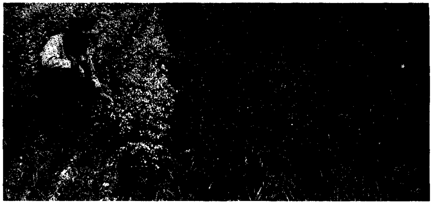
Weeds in this field of small grain (treated part at right) were controlled with 2,4-D. The herbicide costs less than $1 per acre.