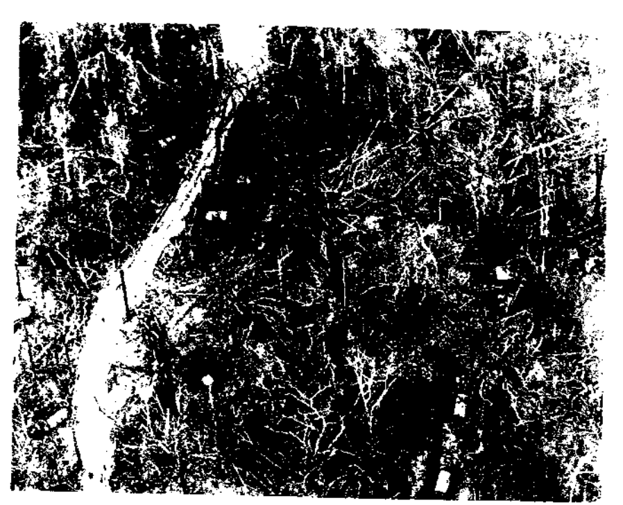
North Vietnamese "truck park" along Ho Chi Minh Trail—located by reconnaissance flights and destroyed by USAF fighters.

The lack of authority to bomb all of Vietnam made it infeasible for the air campaign in Laos to have the desired effect on the enemy's movement of logistics. The enemy supply lines were more vulnerable in the north than in Laos