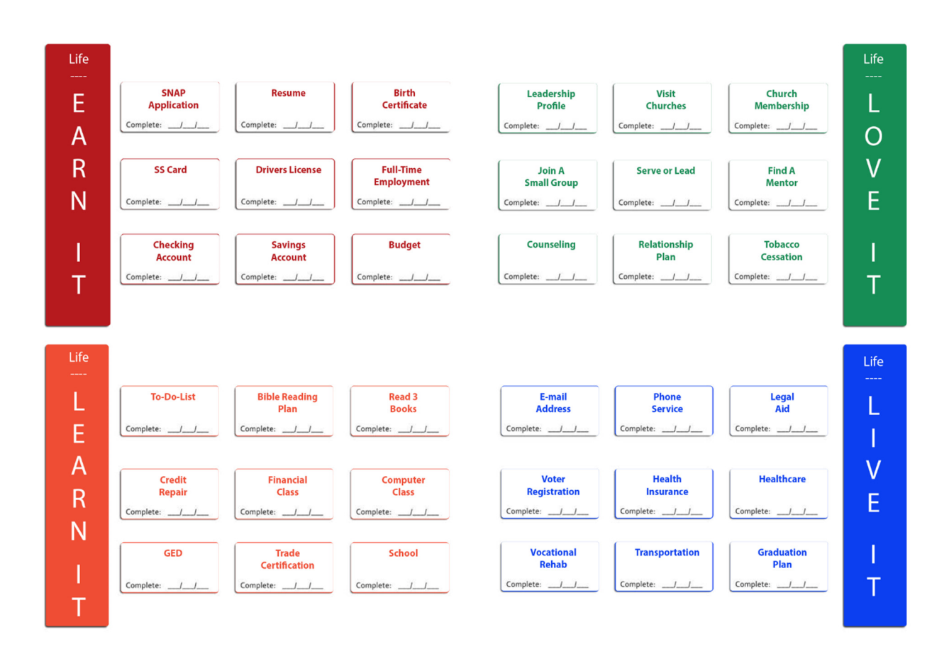
FIGURE 5-1 The life plan, illustrating the four main areas that Foundry recovery program participants progress through, with examples of tasks to be completed in each area.