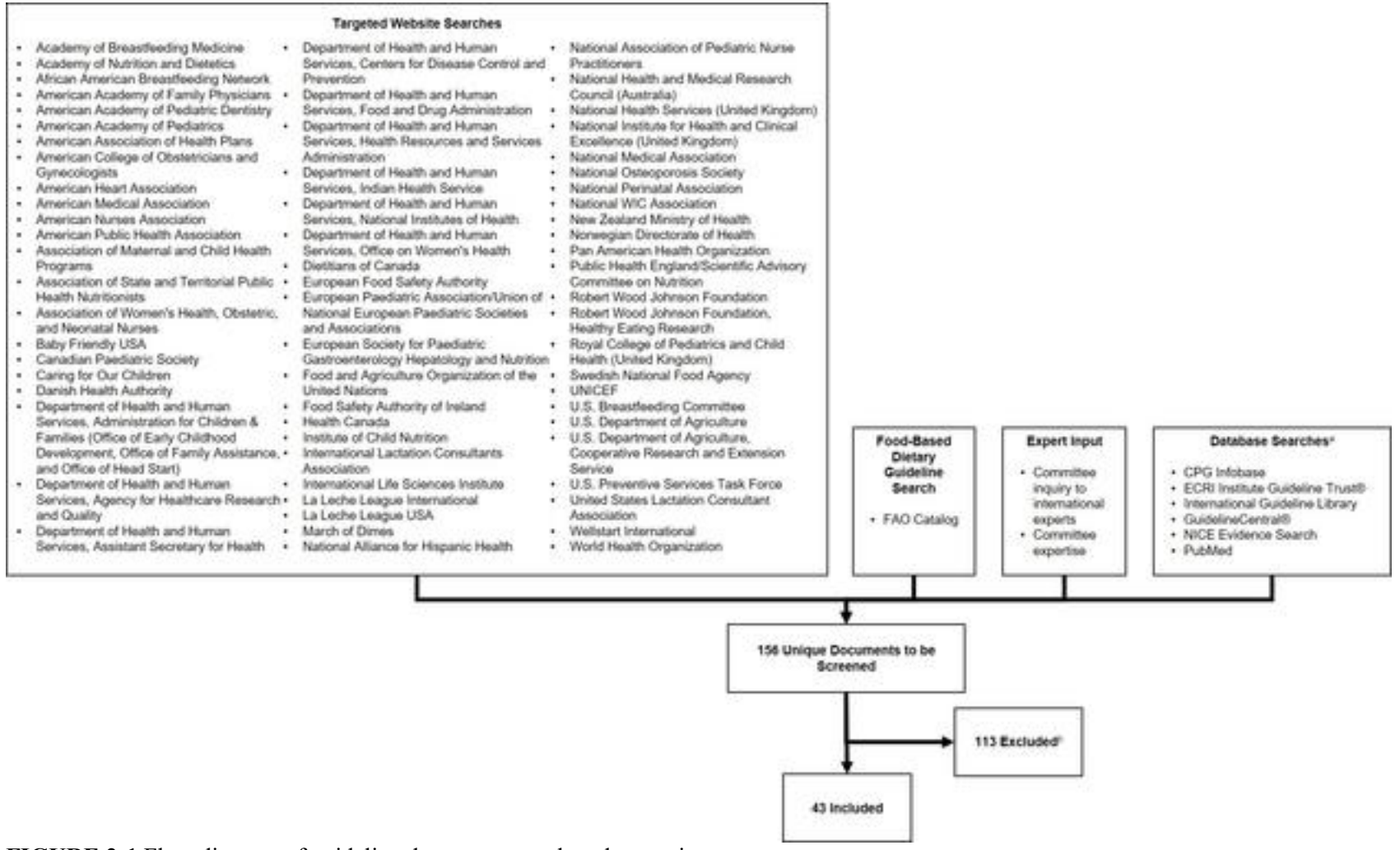
FIGURE 2-1 Flow diagram of guideline document search and screening process.

NOTES: CPG = clinical practice guidelines; FAO = Food and Agriculture Organization of the United Nations; NICE = National Institute for Health and Care Excellence; WIC = Special Supplemental Nutrition Program for Women, Infants, and Children.