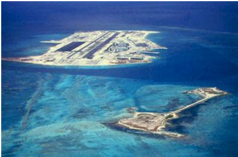
title='Johnston Island with the runway, and smaller Sand Island in the foreground, atoll reef not shown'/>

No, it's not one of the Hawaiian islands, those are already all taken. But it's the closest you can get: Johnston Atoll is around 750 miles (1200 km) SW of Kaua'i. And it has all the trappings of a tropical paradise: 4 islands making up almost 700 acres in a blue lagoon, 20 miles of fringing reef, migrating birds, incredible diving, palm trees, deserted beaches, not to mention a runway to land your private A380 ( http://www.airliners.net/info/stats.main?id=29 ) (747's are old school now).