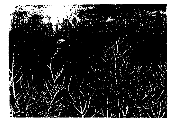
A Vietnamese soldier sprays fuel oil on dense foliage to determine the effectiveness of defoliation by fire. This failed because the fire would not keep burning