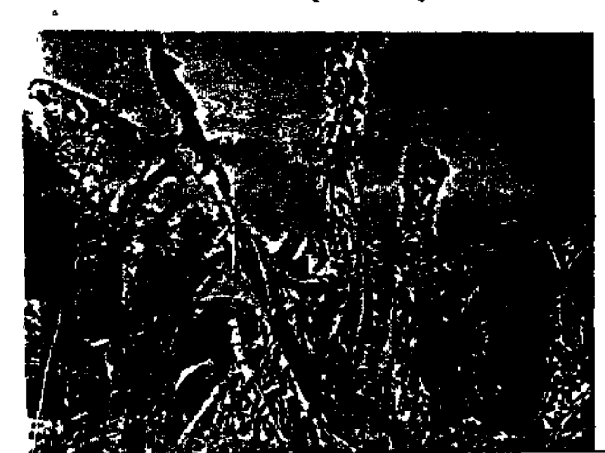
Effects of aerial defoliation