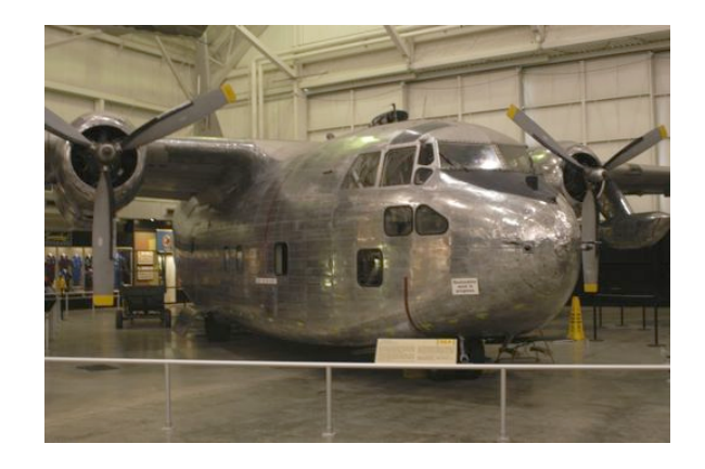
"Patches" Tail #362 Air Force Museum Wright-Patterson AFB, Ohio, after decontamination

TO ESTABLISH THE FACT OF INDIVIDUAL VETERAN'S AGENT ORANGE EXPOSURE PER DEPARTMENT OF VETERANS AFFAIRS [USTIFICATION OF DESIGNATION OF THESE AIRCRAFT AS AGENT ORANGE EXPOSURE SITES]