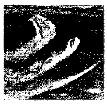
US aircrafts sprayed herbicides over forest and crop fields in South Viet Nam

The total amount of dioxin found in the above herbicides was at least 366 kg[3]. Scientists are of the opinion that due to production technology 2,4,5 T during the 1960s and the need to increase the quantity of the herbicides. However, the US chemical companies in increasing the output of the herbicides also increased the quantity of dioxin to happrox 600 - 680 kg [6, 7]. It should be noted that in tests on animals, just one billionth of a gram of dioxin caused cancer, reproduction problems, and birth defects. [8].