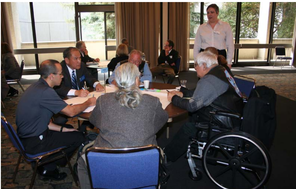
ICV Meeting breakout session.

"We're pleased that so many have come together to coordinate, collaborate and communicate in ways that will identify and address the needs of California's veterans and to develop better ways to serve them,"