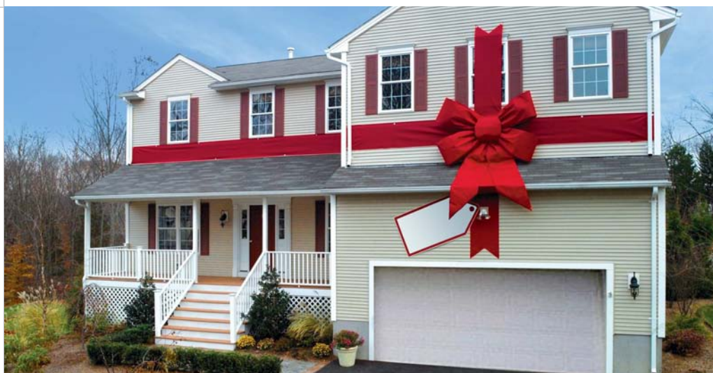
Not actual home. Photo for illustration only.