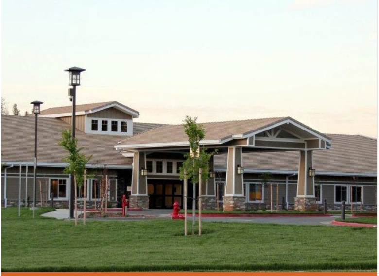
Veterans Home of California - Redding