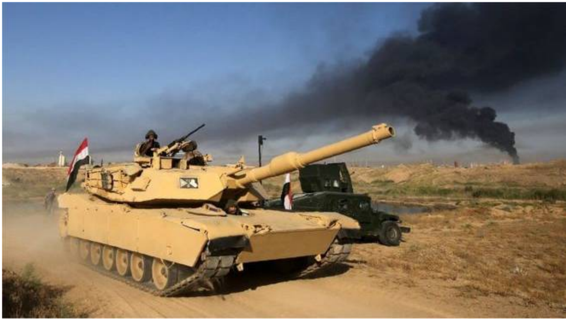
Image captionThe Iraqi government has urged the tens of thousands of civilians in Falluja to leave

Clashes have been reported near the Iraqi city of Falluja hours after Prime Minister Haider al-Abadi announced the start of a military operation to retake it from so-called Islamic State (IS).