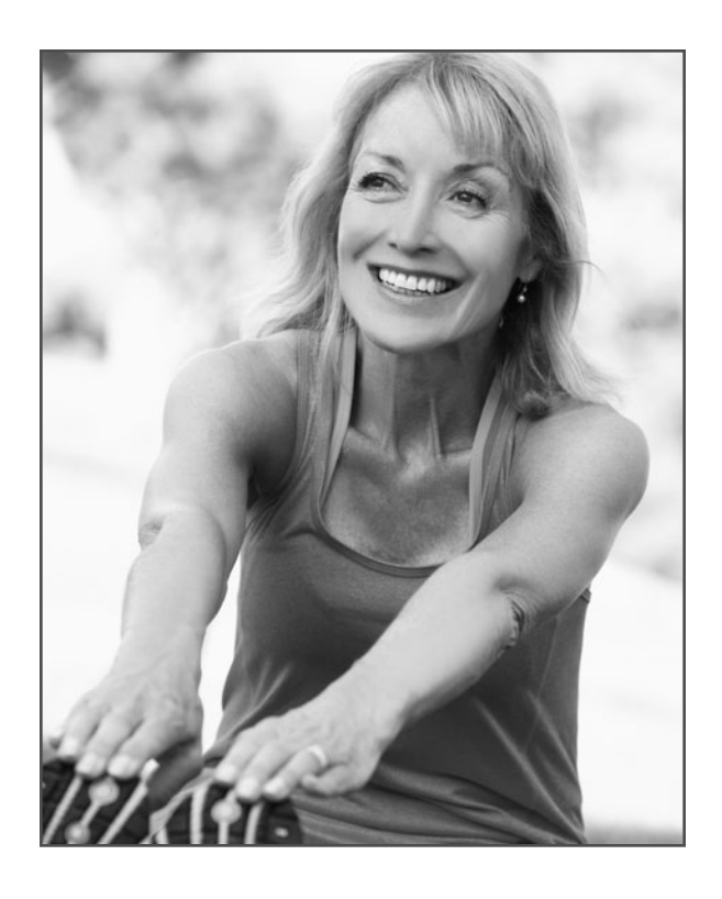
If I am not entitled to premium-free Medicare Part A when I turn 65, can I still use TFL?

Because you are not entitled to premiumfree Medicare Part A, you do not need Medicare Part B to keep your TRICARE benefit. You do not transition to TFL. You may continue enrollment in TRICARE Prime if you live in a PSA, or use TRICARE Standard and TRICARE Extra. For information about TRICARE program options, visit the TRICARE Web site at www.tricare.mil.