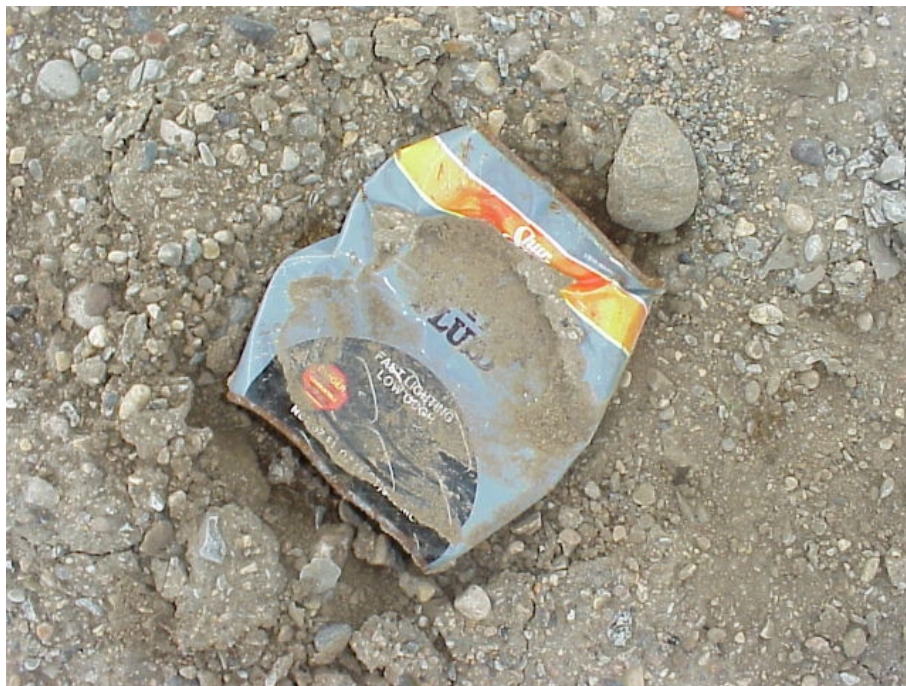
Figure C-22-6. View of Debris, Former Launch Facility C-22