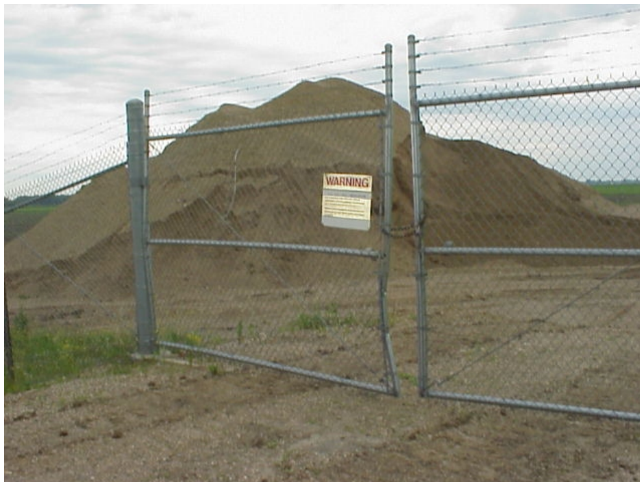
Figure C-22-4. View of Former Launch Facility C-22 Facing Northeast