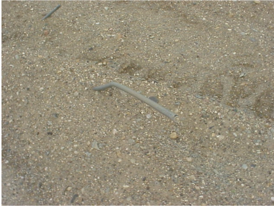
Figure C-22-5. View of Exposed Metal, Former Launch Facility C-22