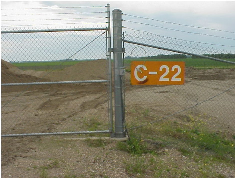
Figure C-22-3. View of Former Launch Facility C-22 Facing East