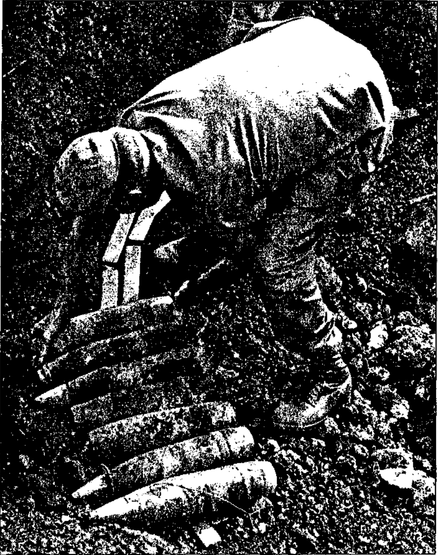
FIGURE 93.—Rounds of 106 mm white phosphorus are placed on top of C-4 explosive at an ammunition dump.

United States because of its availability on many military installations, although rigid control of its use makes this unlikely.