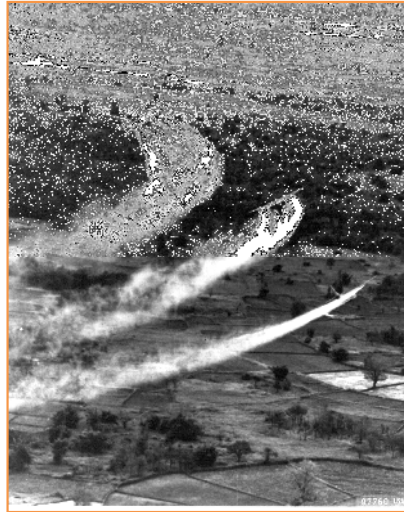
Agent Orange Spraying, 1961-1971

(generally newer to older): Note: About one-quarter of all C-123K/UC-123K aircraft were used for spraying Agent Orange in Vietnam until 1971. Most Vietnam-based aircraft returned USAF Reserve inventory in 1971-1972, then flown for regular airlift and aeromedical evacuation missions until 1982 when most were sent to Davis-Monthan AFB AZ for storage with some diverted to museum use. Three bases were