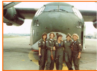
Flight Nurses in Front of C-123 Aeromedical Evacuation Aircraft

9 Oct 96, Mr Ronald Black, AMARC, Talking Paper . Detailed the Aug 1996 testing by DO Consulting Ltd and ALTA on all C123s (17 in total.) "All samples tested positive for traces of dioxin." [redacted]