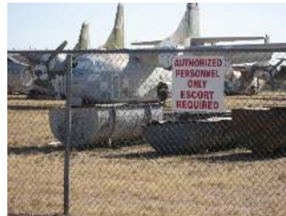
Unique C-123 HAZMAT Quarantine Storage, Davis-Monthan AFB AZ, 1982-2010