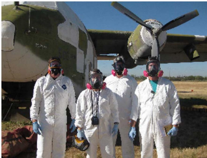
USAF-Mantaded HAZMAT protection once C-123 contamination was identified.. We flew in regular flight suits without such protection

1961-1971: C-123 transports sprayed Agent Orange in Vietnam and became contaminated with dioxin. The warplanes were flown by the USAF until 1982, then retired. In 2000 USAF confirmed in Federal court C-123 fleet remained "heavily contaminated" and "a danger to public health."