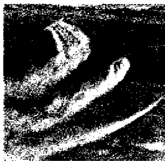
US aircrafts sprayed herbicides over forest and crop fields in South Viet Nam

The total amount of dioxin found in the above herbicides was at least 366 kg[3]. Scientists are of the opinion that due to production technology 2,4,5 T during the 1960s and the need to increase the quantity of the herbicides. However, the US chemical companies in increasing the output of the herbicides also increased the quantity of dioxin to approx 600 - 680 kg [6, 7]. It should be noted that in tests on animals, just one billionth of a gram of dioxin caused cancer, reproduction problems, and birth defects. [8].