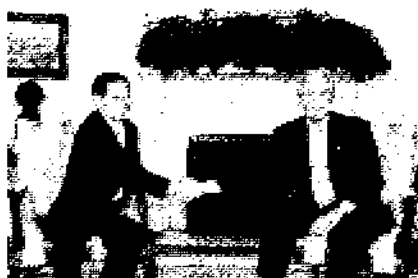
President Nguyen Minh Triet and President George W. Bush in Washington DC, June, 2007.

Some foreign organizations and individuals have been cooperating with Viet Nam in research and overcoming of the consequences of Agent Orange/dioxin. Viet Nam highly appreciates the support in developing the UNDP project on the treatment of Agent Orange/dioxin contamination in heavily polluted areas, and their concern for disabled children – victims of Agent Orange/dioxin - from UNICEF, humanitarian activities of some organizations and individuals from Japan, Germany, Norway, England, and the United States.. Some scientific research works on the adverse impacts of agent orange/dioxin on the environment and people of Viet Nam have been conducted by scientists from Japan, Germany, Canada, and Russia in cooperation with the Vietnamese scientists. Some Peace, Friendship villages have been built to provide care for Agent Orange/dioxin victims in Viet Nam funded by the Düsseldorf Peace Village and Veteran Associations of Germany, South Korea.