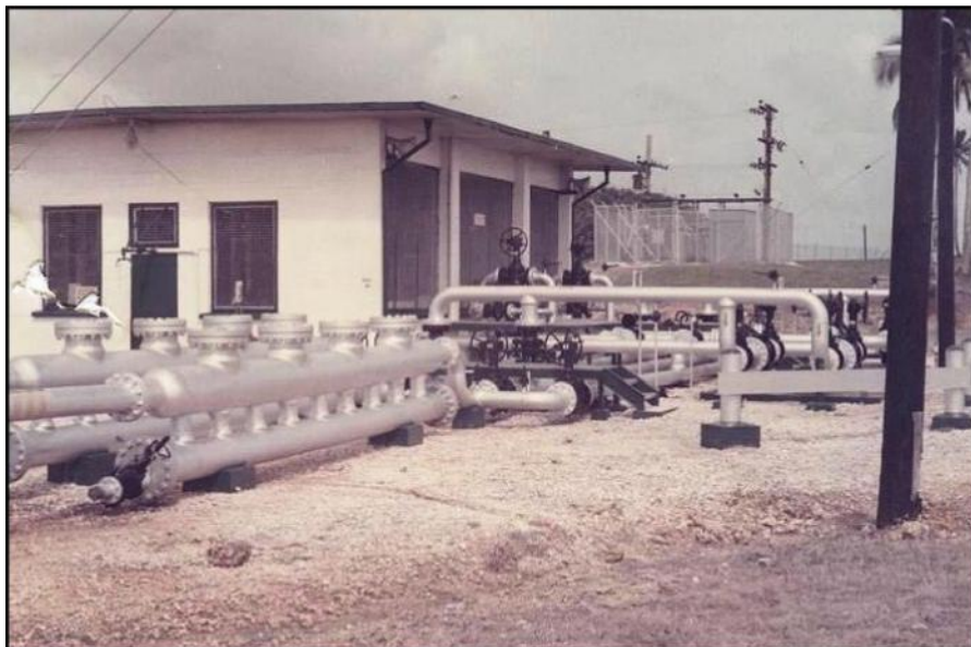
Here is a picture of the cross island pipeline booster station. As you can see there is no vegetation. Sgt. Foster did a good job spraying. The reason I took the picture is we just got finished painting everything.