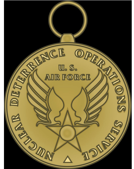
Eligibility for Nuclear Deterrence Operations Service Medal expands.

For more information, go to MyPers . Select "search all components" in the drop down menu and enter "NDOSM" in the search window. More information is also available on the Air Force Retiree