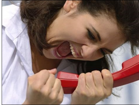
Each year, the Federal Communications Commission receives more than 200,000 complaints about unwanted calls.

numbers. Scammers may spoof their caller ID to display a fake number that appears to be local. If you answer such a call, hang up immediately.