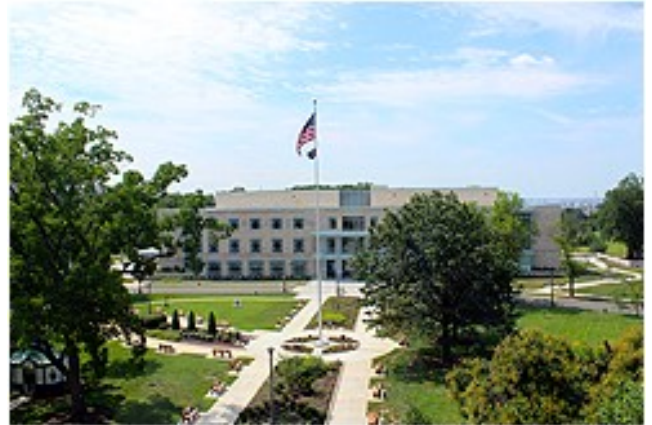
The Armed Force Retirement Home in Washington is one of two locations in the United States. This facility can trace its roots to 1811 when the nation made a promise to care for its older and disabled veterans. The first facility in Washington was completed in 1851.