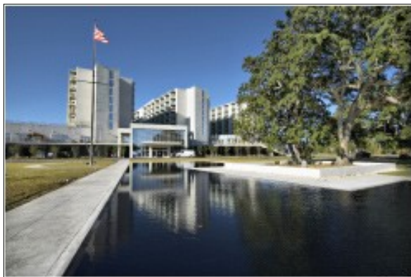
The original Armed Force Retirement Home in Gulfport, Mississippi, was destroyed by Hurricane Katrina in 2005. It was rebuilt and opened to residents in 2010.

For those accepted into independent living, the AFRH also offers higher levels of care –