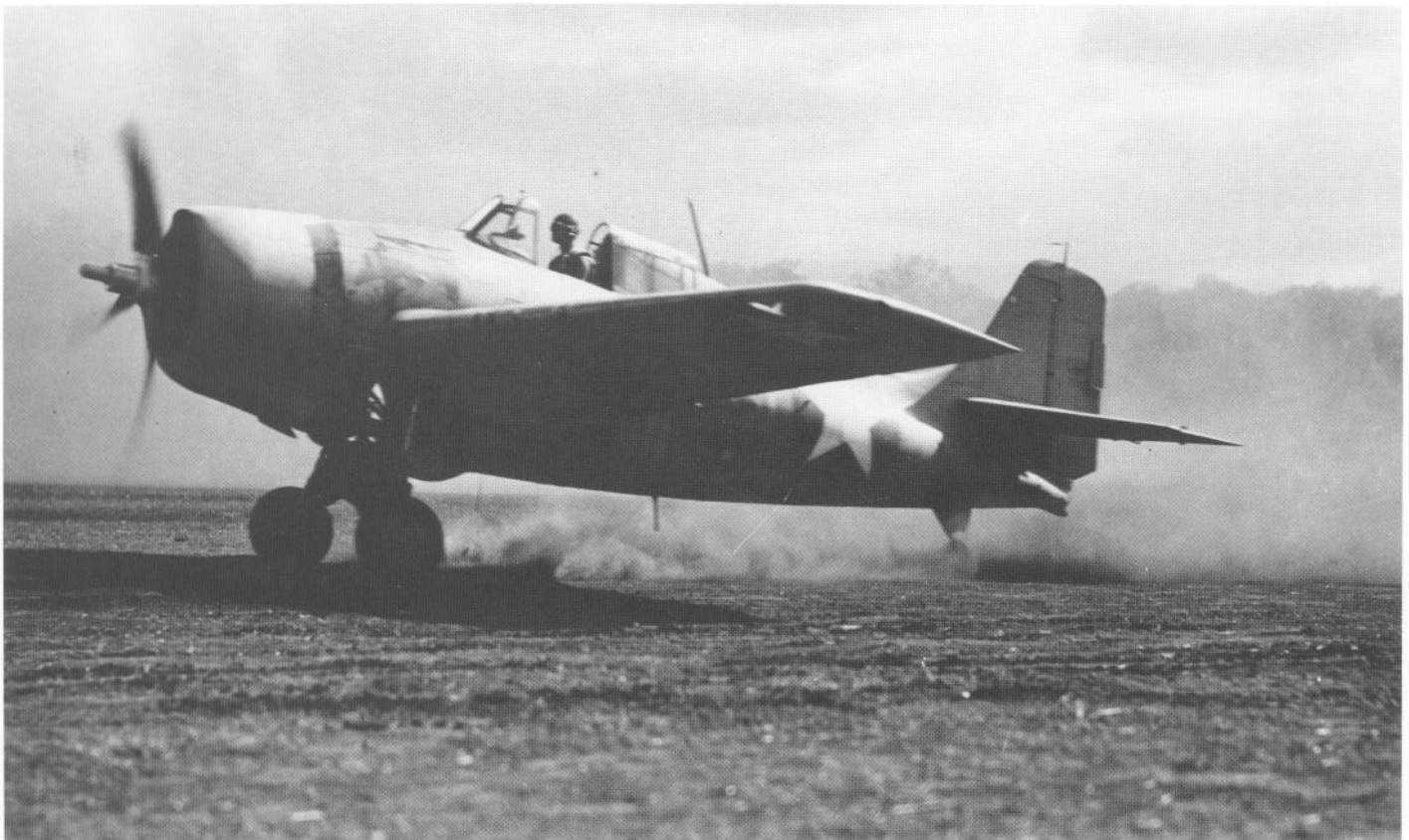
Grumman F4F Wildcat fighters were the mainstay of the "Cactus Air Force" at Guadalcanal prior to the introduction of the F4U.

Maj. Henderson's SBDs reached the enemy force ahead of the slower SB2U-3s at 0800. They went into a wide circle at 8,500 feet preparatory to launching a glide-bombing attack from 4,000 feet above the carriers. This was because the