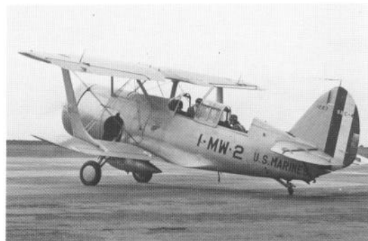
In 1940, the 1st MAW HQ aircraft was this Curtiss SBC-4.

An important step toward organized expansion was taken on March 1, 1942. Squadrons were broken into as even a