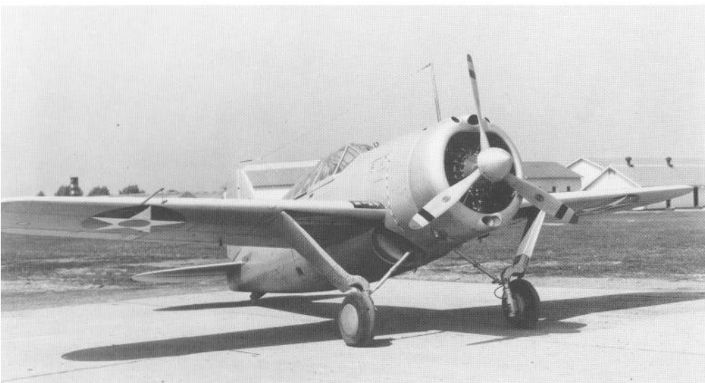
The Brewster F2A Buffalo suffered greatly in combat against the Japanese Zero at Midway.