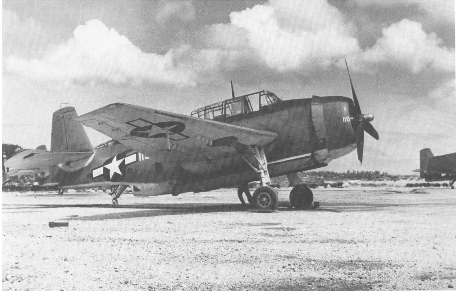
Above, the Grumman-designed TBF/TBM was used only as a regular bomber and rocket-firing aircraft by the Marine Corps. Right, though obsolescent by December 7, 1941, the SBD continued to serve with distinction through the Philippine campaign in 1945.