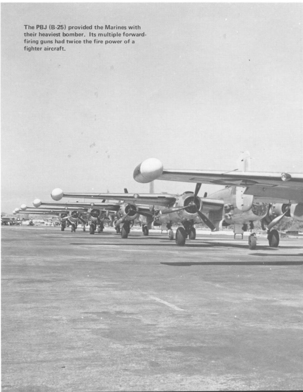
The PBJ (B-25) provided the Marines with their heaviest bomber. Its multiple forward-firing guns had twice the fire power of a fighter aircraft.

While Marine Aviation was equipped with carrier-suitable aircraft, both it and the Navy were caught in a bind, the Marine Corps with respect to carrier training and the Navy regarding availability of ships for the Marine flyers. The net result was that Marine Aviation was relegated to the backwaters of the war, almost entirely from the reduction of Rabaul in early 1944 until the Philippines and Okinawa in 1944 and 1945. There wasn't another chain of islands like the Solomons in all the right places in the central Pacific, or a division of carriers that could take Marine squadrons into the many amphibious assaults that marked the central Pacific route to Japan. Even so, several MAGs were displaced