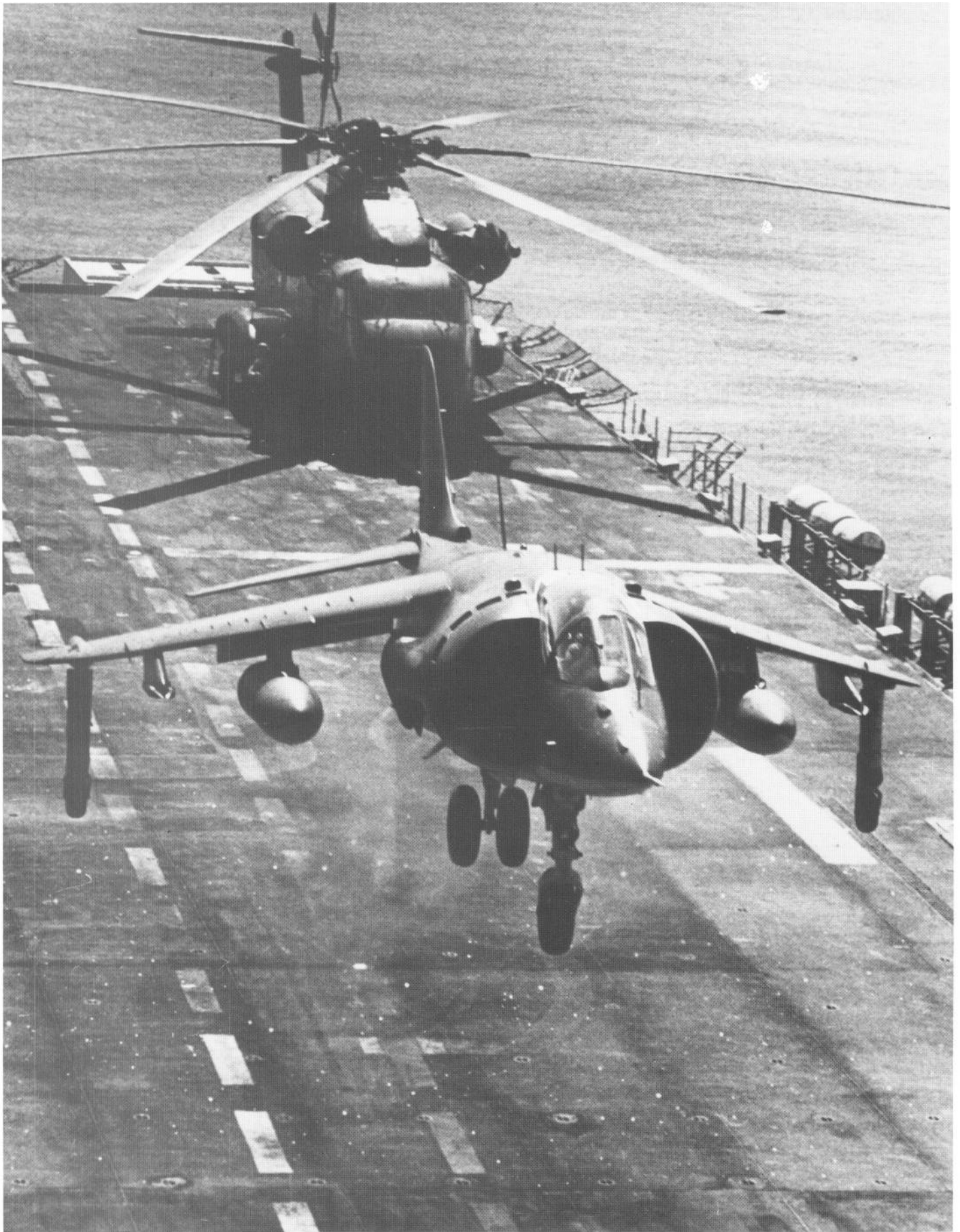
AV-8s brought one of the newest techniques for close air support to the Marine Corps.