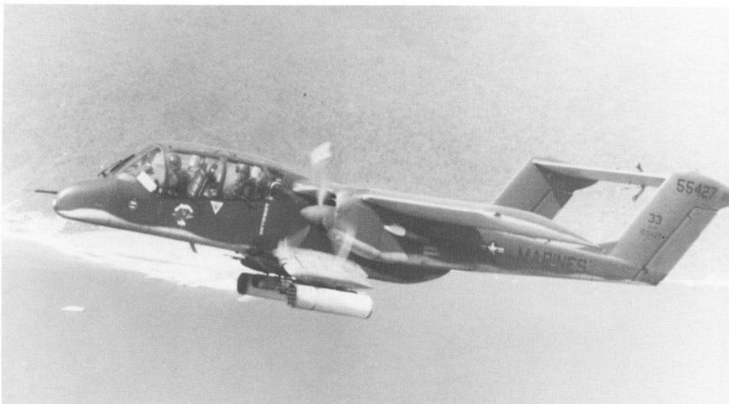
The OV-10 Bronco took over the observation and light-attack missions.

Marine Aviation participated in the minesweeping chore with squadrons assigned to 7th Fleet carriers and amphibious shipping, both with fixed-wing fighters and electronic warfare