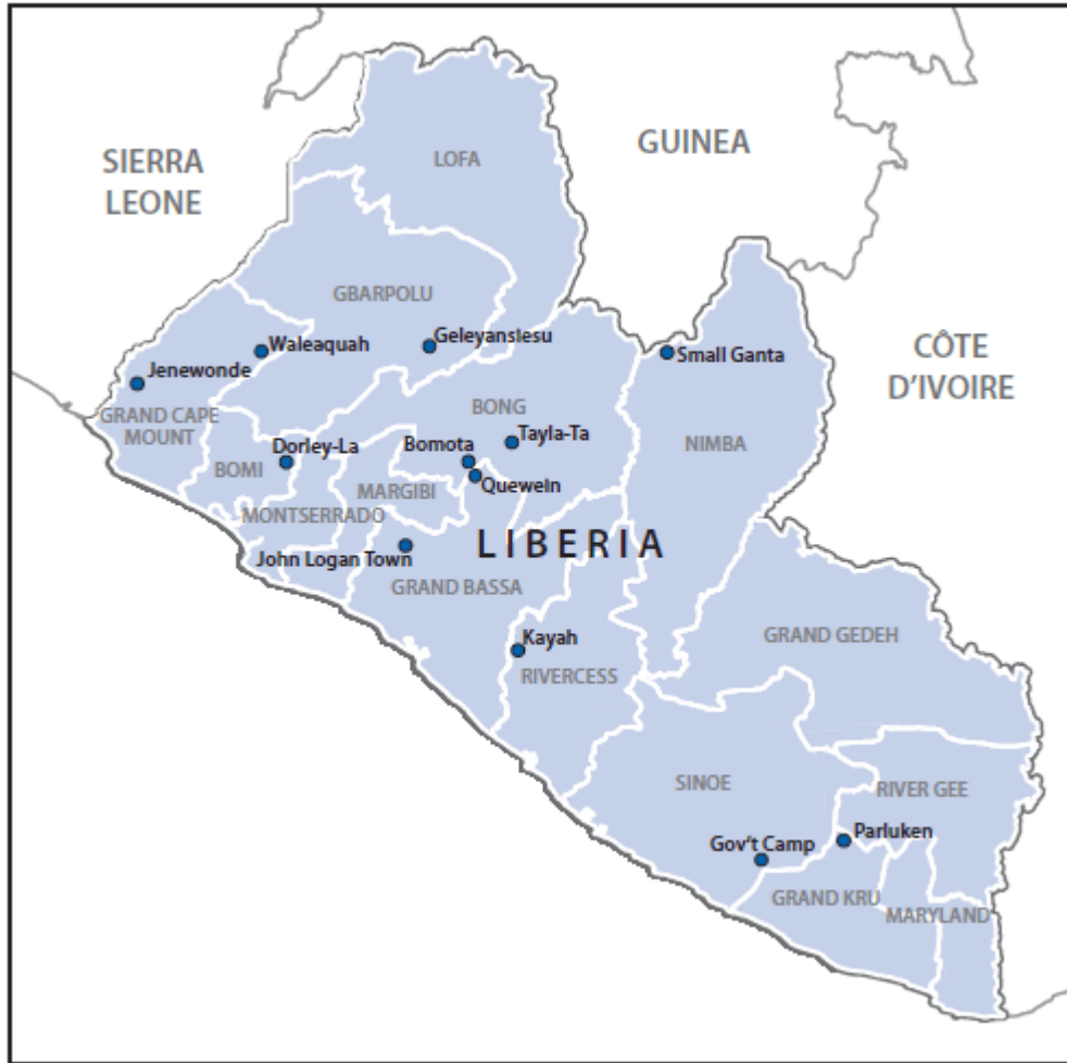
FIGURE 1. Locations of 12 Ebola outbreaks in remote communities — Liberia, July 16–November 20, 2014

Alternate Text: The figure above is a map of Liberia showing the locations of 12 Ebola virus disease outbreaks in remote communities during July 16–November 20, 2014.