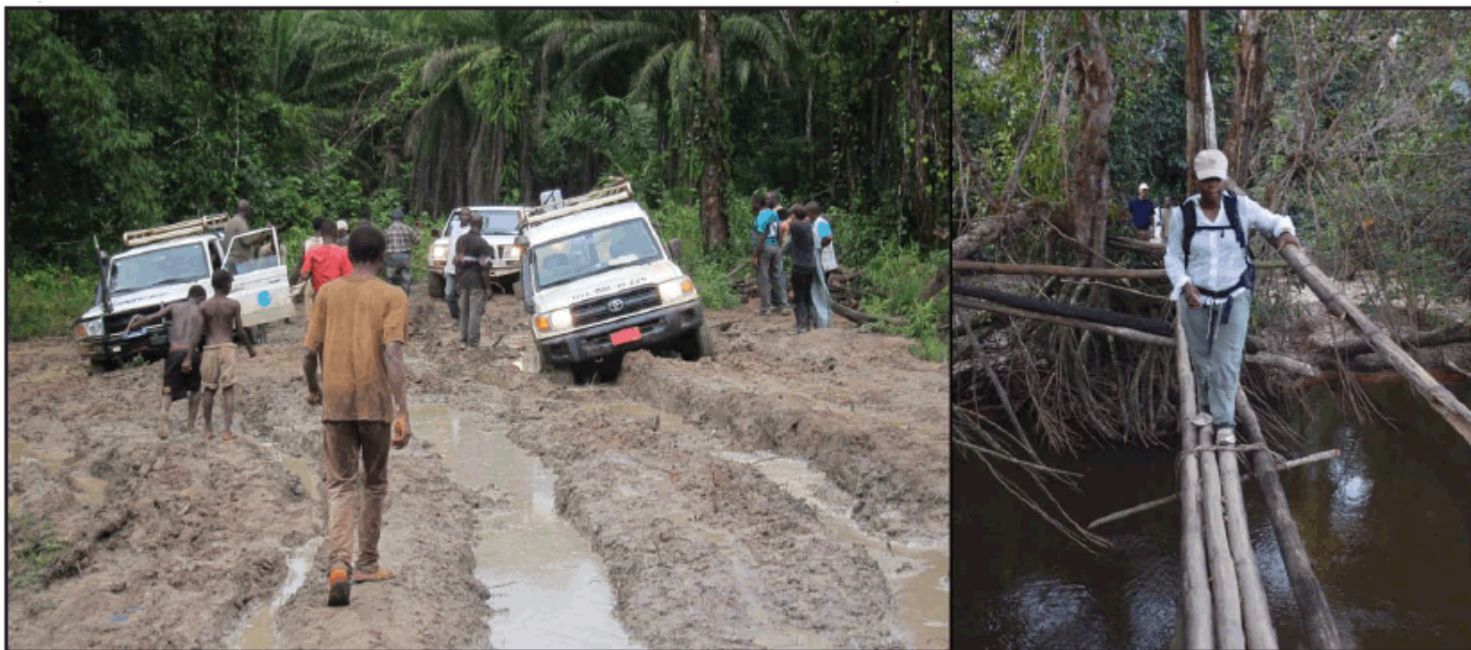
FIGURE 3. Challenges facing Ebola teams traveling to remote communities in Liberia have included impassable roads such as this one on the way to John Logan Town (left) and difficult river crossings such as this one on the way to Bomota (right)