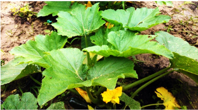
Zucchini is just one type of vegetable grown in the garden.

With support from the Office of Patient Centered Care (OPCC), the DC WRIISC at the Washington, DC VA Medical Center is working with Veterans and community partners to establish the “All Vets Garden,” which will serve multiple therapeutic purposes. Gardening plots are located on the grounds of the Armed Forces Retirement Home, adjacent to the DC VA Medical Center, and will be directed and run by Veterans.