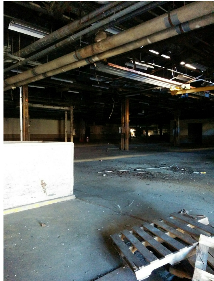
Photo 5 (left). Collapsing interior wall on Building No. 4.