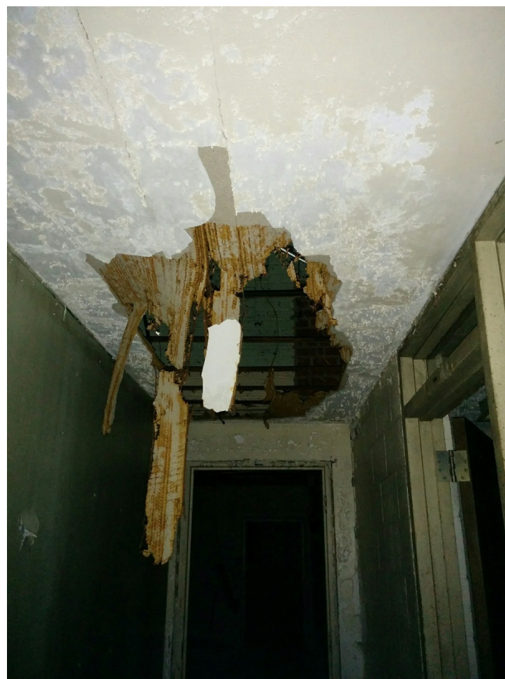
Photos 1 & 2. Evidence of deteriorating ceiling and falling debris in Building No. 2.