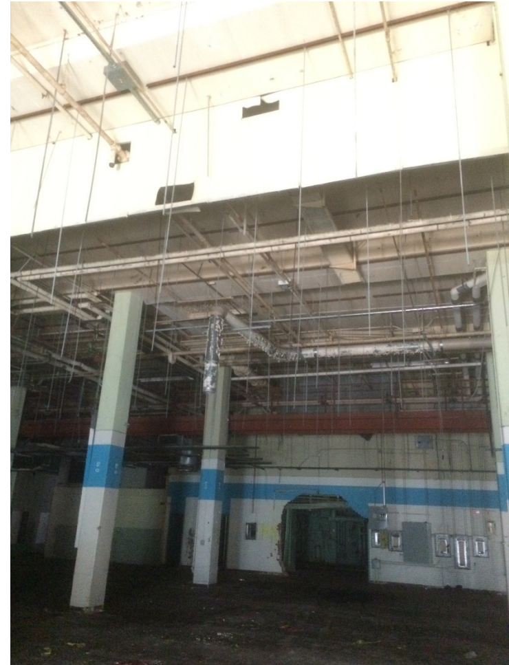
Photo 3 (left). Collapsing roof in Building No. 2.