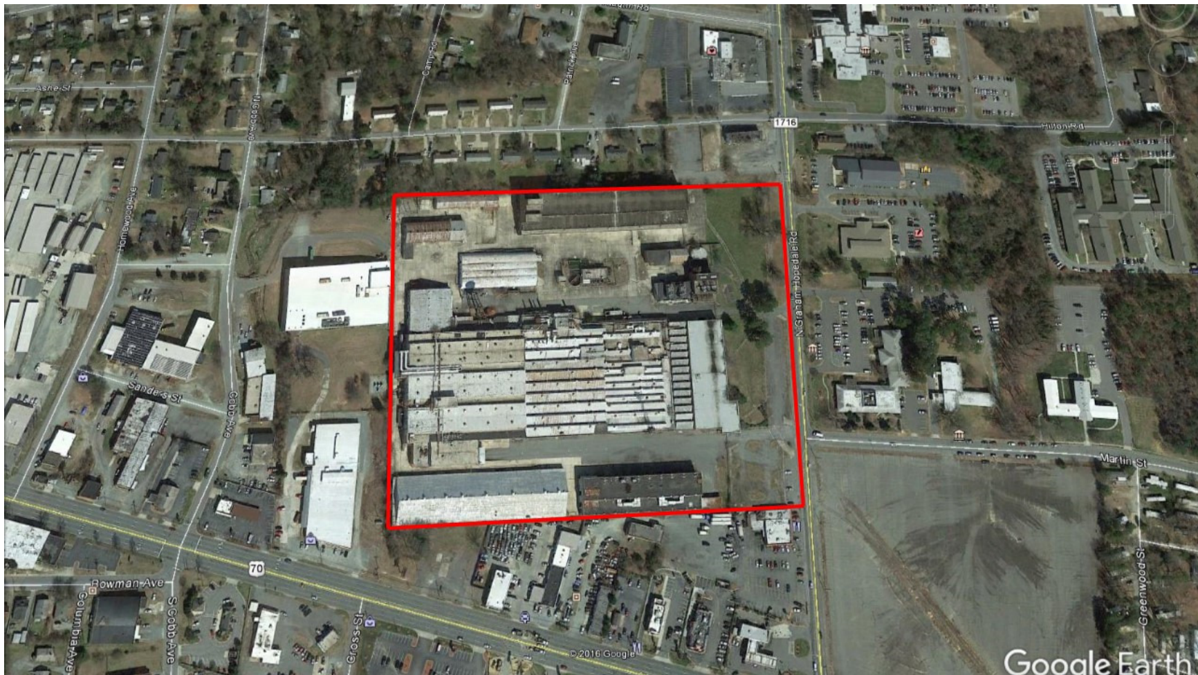
Figure 1. Map of the Tarheel Army Missile Plant site. Property line is marked in red. Homes are located immediately north and northwest of property line.