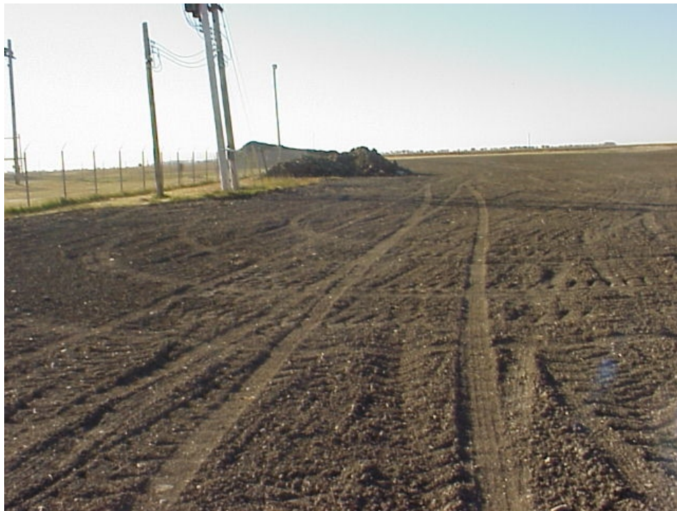
Figure A-0-4. View of Graded Sewage Lagoon at Former Missile Alert Facility A-0, Looking South