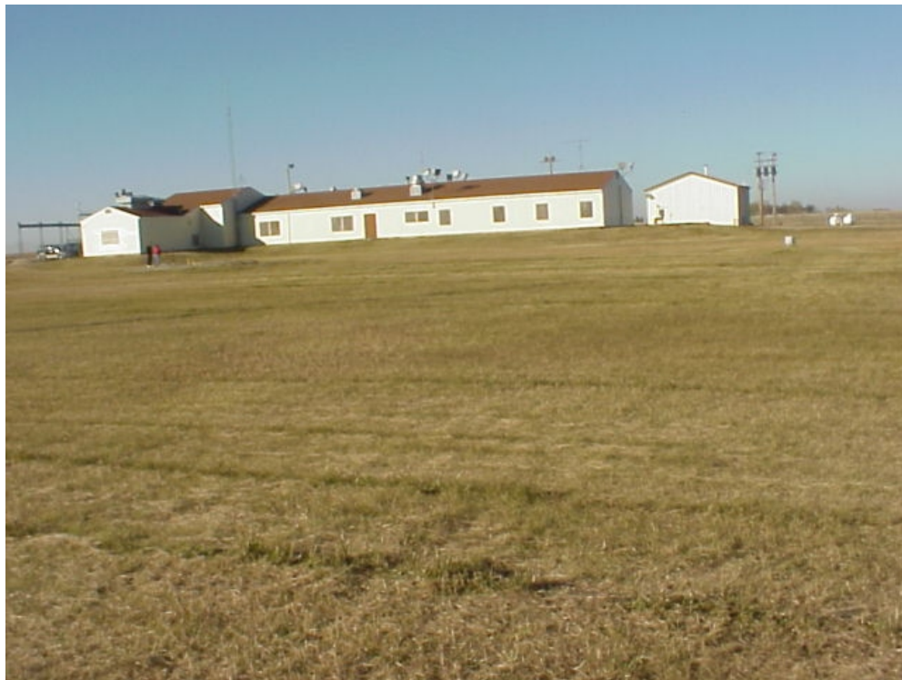
Figure A-0-3. View of Former Missile Alert Facility A-0, Looking East