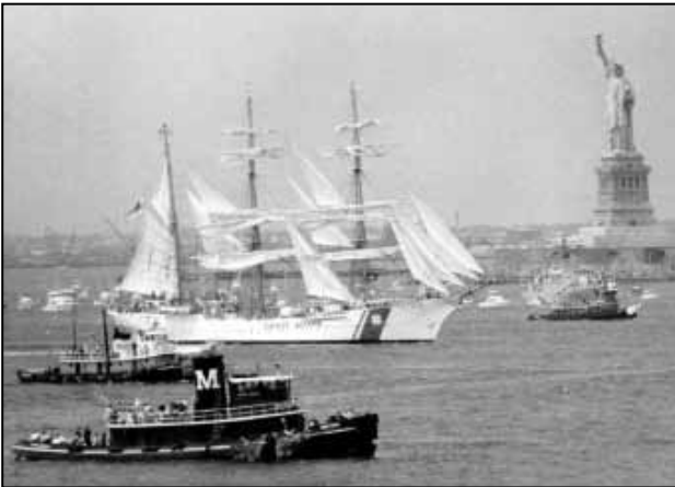
The Eagle debuted her new racing stripe during OpSail '76.

Since the 1970s, the Coast Guard Racing Stripe and color scheme has been applied even to assets not commonly associated with the service. With alterations in coloration and angle, the Racing Stripe has become a symbol for sea service vessels at the federal, state, county, and municipal levels throughout the US and for scores of foreign sea services.