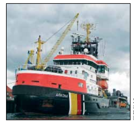
Germany's Küstenwache is made up of multiple government agencies. Vessels with black hulls are part of the Federal Waterways and Shipping Administration.

The Water and Shipping Administration is a civilian authority of the Ministry