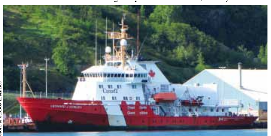
SEA HISTORY 139, SUMMER 2012

Canadian Coast Guard offshore patrol vessel Leonard J. Cowley