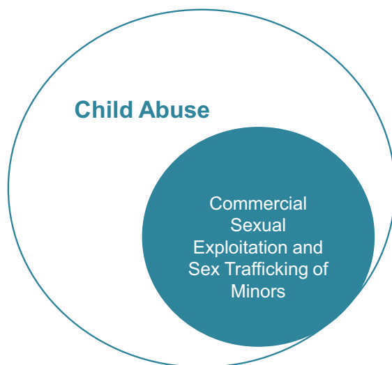
FIGURE 1 Commercial sexual exploitation and sex trafficking of minors are forms of child abuse.

NOTE: This diagram is for illustrative purposes only; it does not indicate or imply percentages.