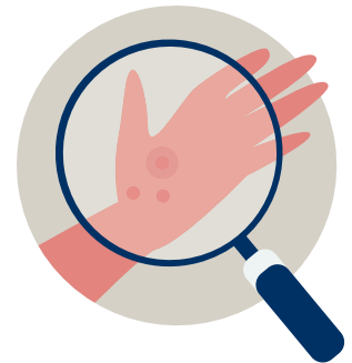
Dermatology (skin care)